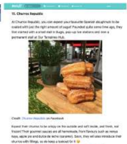
Churros Republic's churros are made fresh and served piping hot. In fact, the Churros Republic team use a machine that cooks out the dough before it's dunked in hot oil and fried.