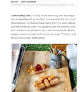
Churros Republic: Freshly made every day and the recipe was inspired by a Spanish Chef. So the product is very much close to Spain in what we have heard from the team. It took them 6 months to attain the crispiness on the exterior while soft on the inside which literally melts in our mouth. All the sauces are homemade and are not too sweet. Try them and tell us what is your preference!