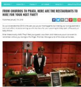
These churros made fresh and served piping hot, in your home, the Churros Republic team use a machine that cooks the dough before it's dunked in hot oil and fried and golden-brown. The process is an essential step in preparing the churros. In fact, the churros are not made until the dough is fried.