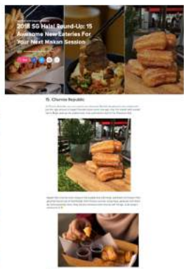
Churros Republic's churros are made fresh and served piping hot. In fact, the Churros Republic team use a machine that cooks out the dough before it's dunked in hot oil and fried.