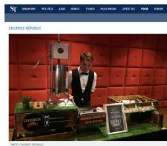
The Churros have churros made fresh and served piping hot. In fact, the Churros Republic team use a machine that cooks out the dough before it's dunked in hot oil and fried.