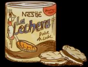
Dulce De Leche