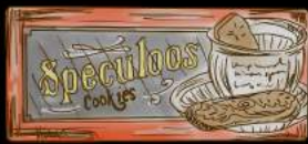
Speculoos Cookie butter